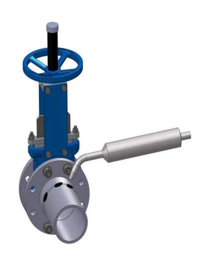
3. Attach the flanges at several points to the piping using a welding electrode.