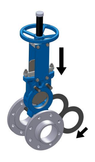
1. Position the gate valve with screw studs together with gaskets between the flanges.