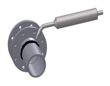
5. Weld the flanges to the piping.